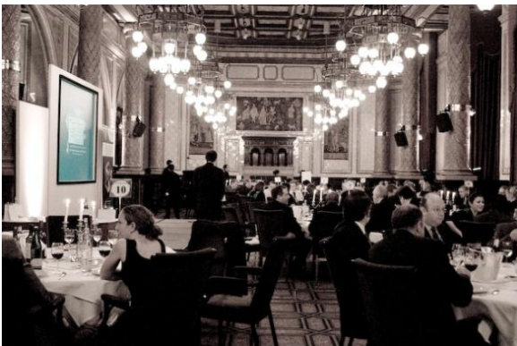
The Whitehall suite

The 2011 Annual Dinner and Trainee of the year Awards held at the Royal Horseguards Hotel was a huge success and a great celebration of all that is best about our business sector.